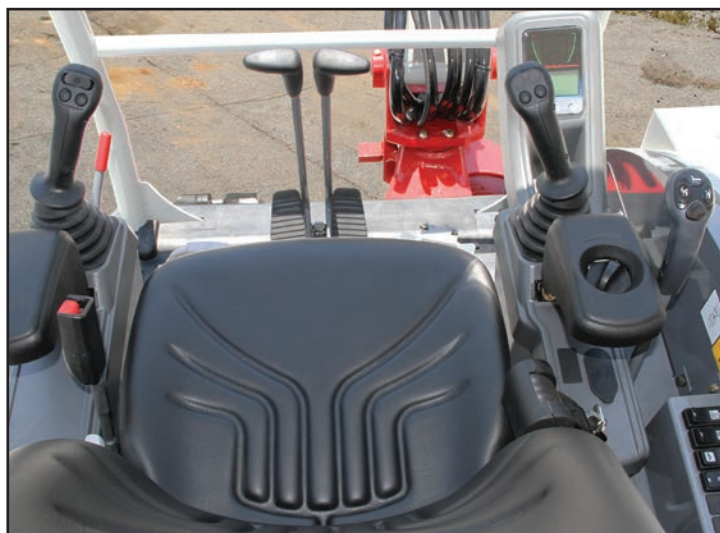
Automotive Styled Interior