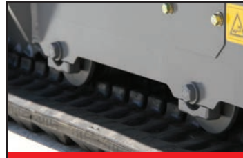
Triple Flanged Track Rollers