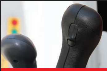
2-Speed Travel w/ Auto Shift