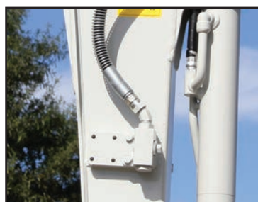
Auxiliary Hydraulic Lines