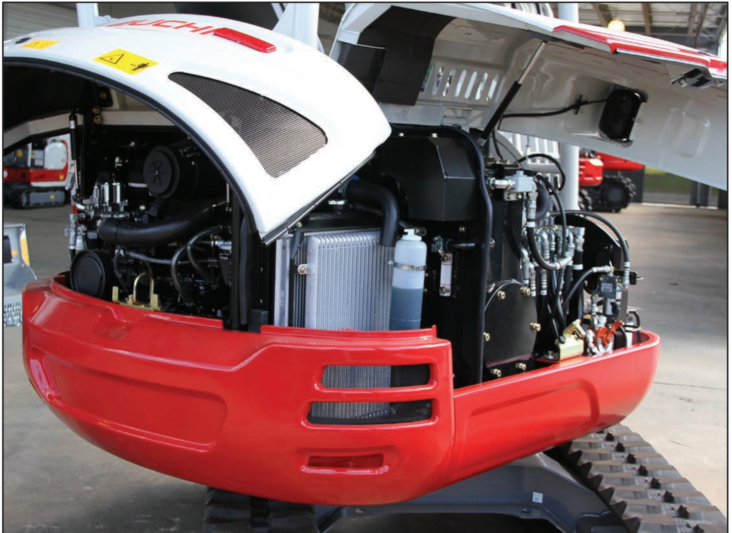
Large lockable service hoods provide vandalism protection and outstanding maintenance access.

The operator is protected by a ROPS / TOPS /OPG protective structure that keeps the operator safe and comfortable on any job site.