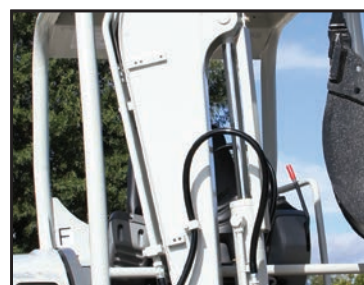
Main Boom Cylinder Guard