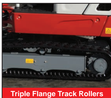
Triple Flange Track Rollers