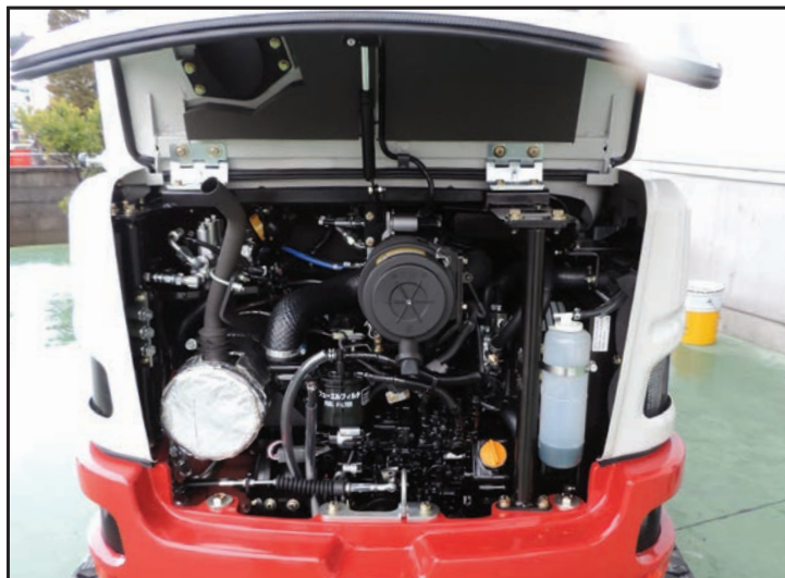
Large Lockable Service Covers Provide Ground Level Access