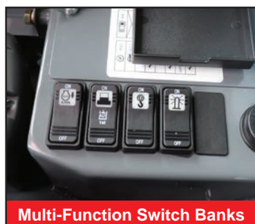
Multi-Function Switch Banks