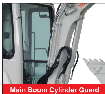
Main Boom Cylinder Guard