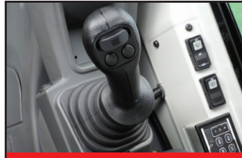
Pilot Operated Controls