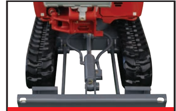
Retractable Track Frame

The TB225 features all steel construction, a spacious operator station, smooth hydraulic pilot joystick controls that deliver precise responsive controls. The TB225 provides the operator with the best in class engine output that allows more power and increases productivity.