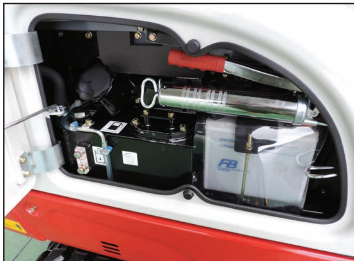
Convenient Service and Maintenance Access