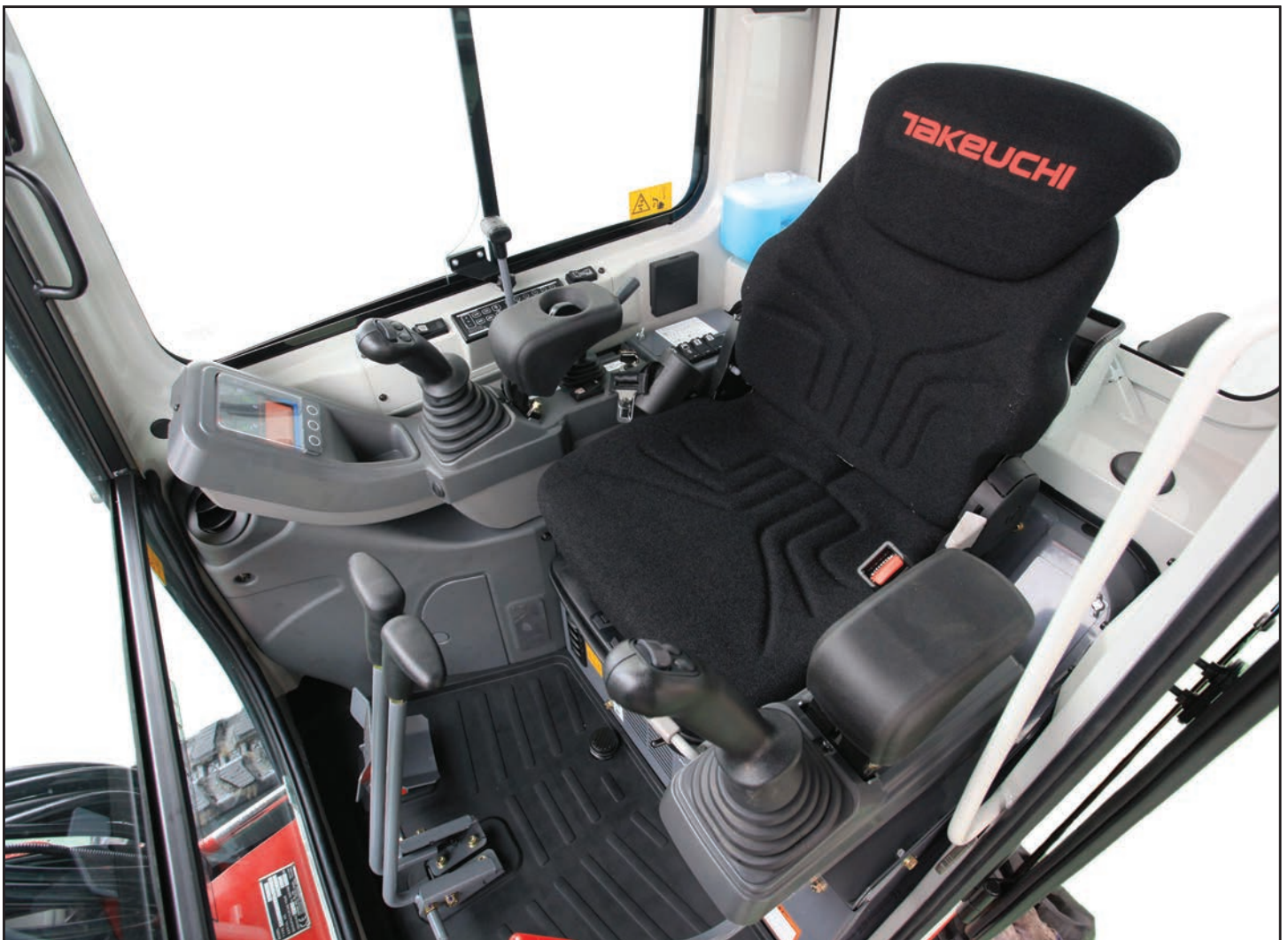
Spacious Operator's Station with Easy to Reach Controls and Switches.

The operator is protected by a ROPS / TOPS / OPG protective structure that keeps the operator safe and comfortable on any job site.